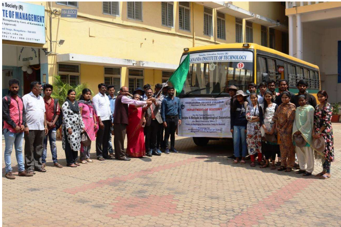
Fig-1. Inaugural programme: Inaugurated by Principal and HOD'S of Department of BA.