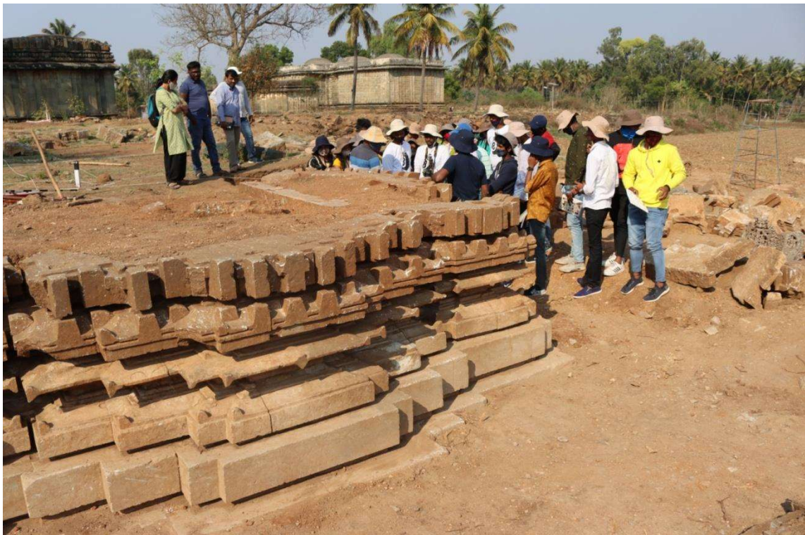
Fig- 6 Explaining the excavation methods in the excavation site at Halebidu by ASI Authority.