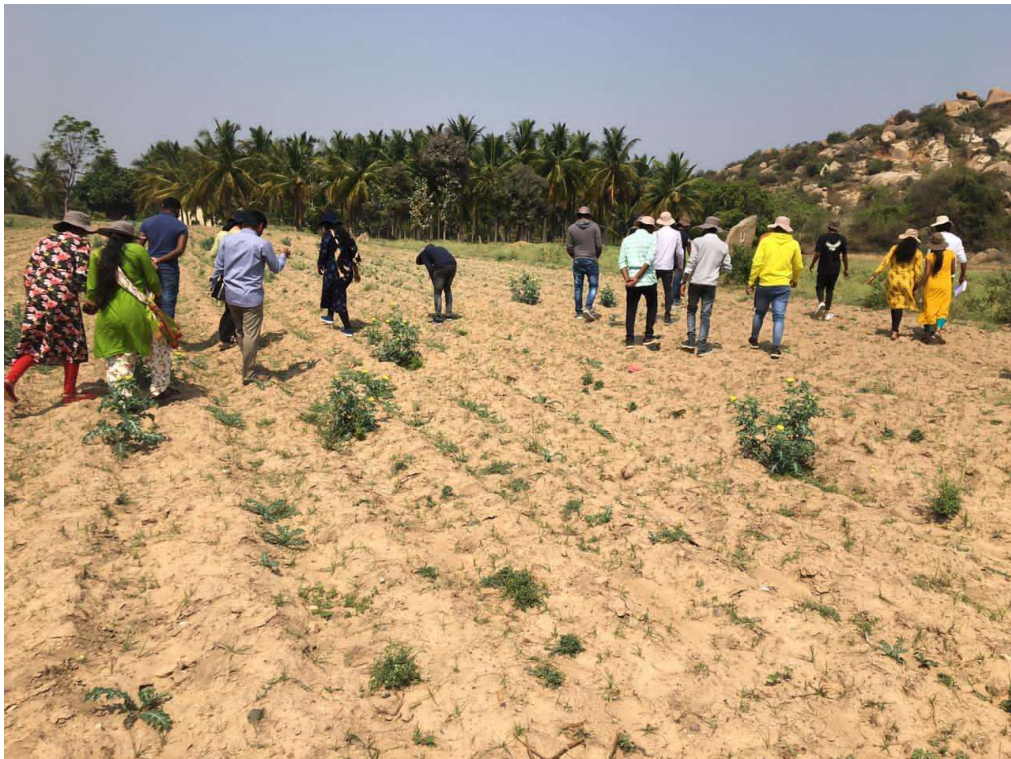
Fig 4: Exploring the Megalithic and Early Historic Habitation site at Salapur