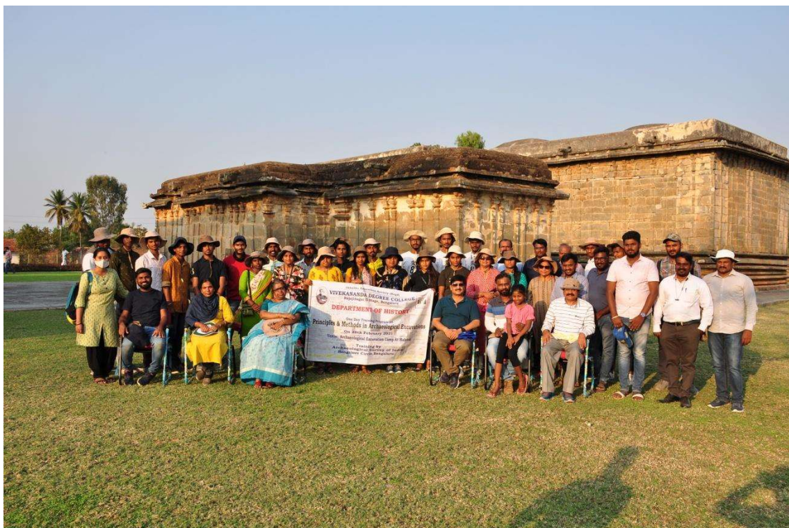
Fig 9: Group photo with Resource persons and Excavation Authority.