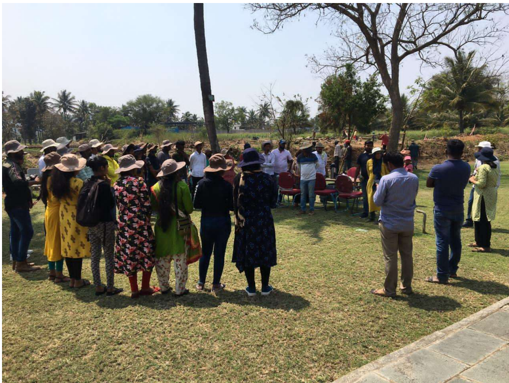
Fig 8: Discussion Session: Students interaction with Excavation Authority, Halebidu.