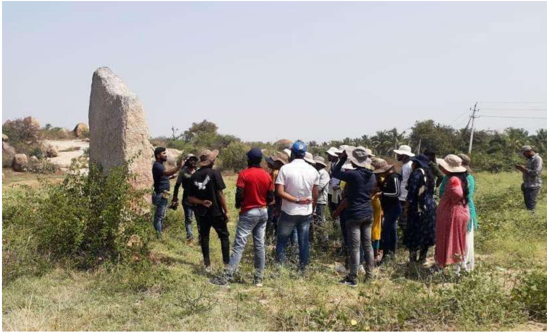
Fig-3. Explaining the Megalithic Monuments and Settlement pattern of the Site at Salapur by Praveen Kumar K