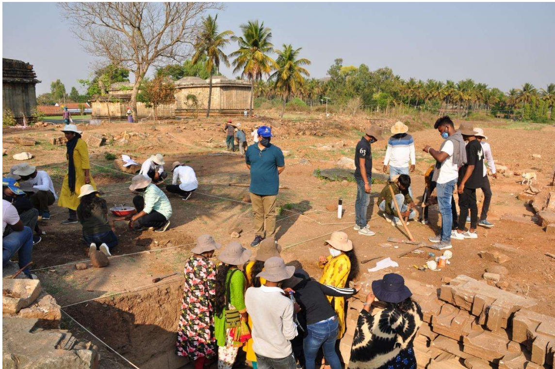
Fig-7. Students participation in the Excavation at Halebidu.